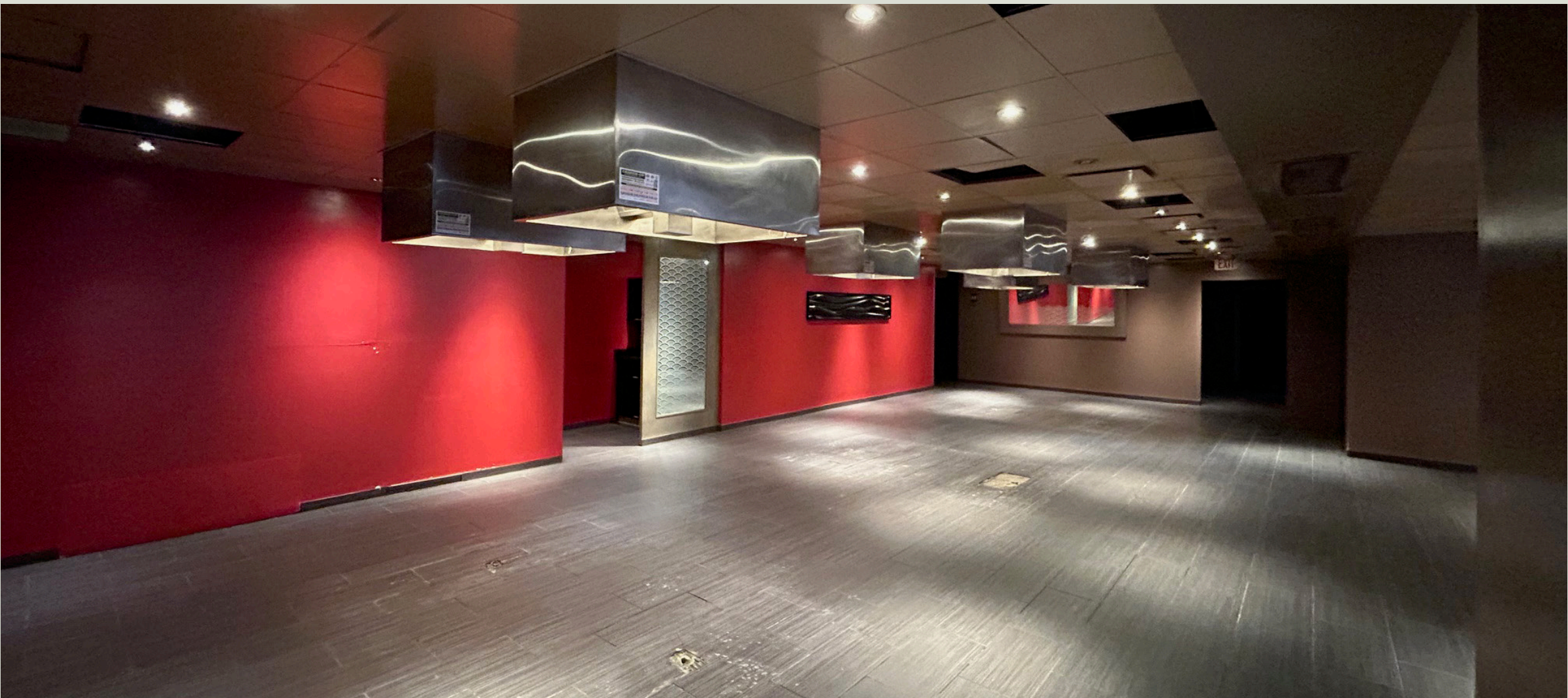
Interior as Unoccupied