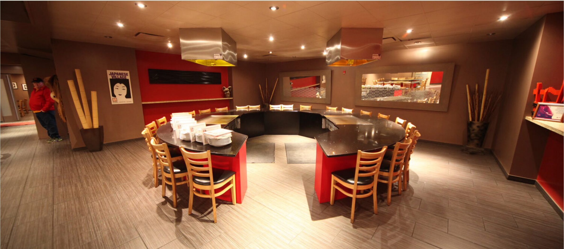
Interior as Occupied by Former Tenant