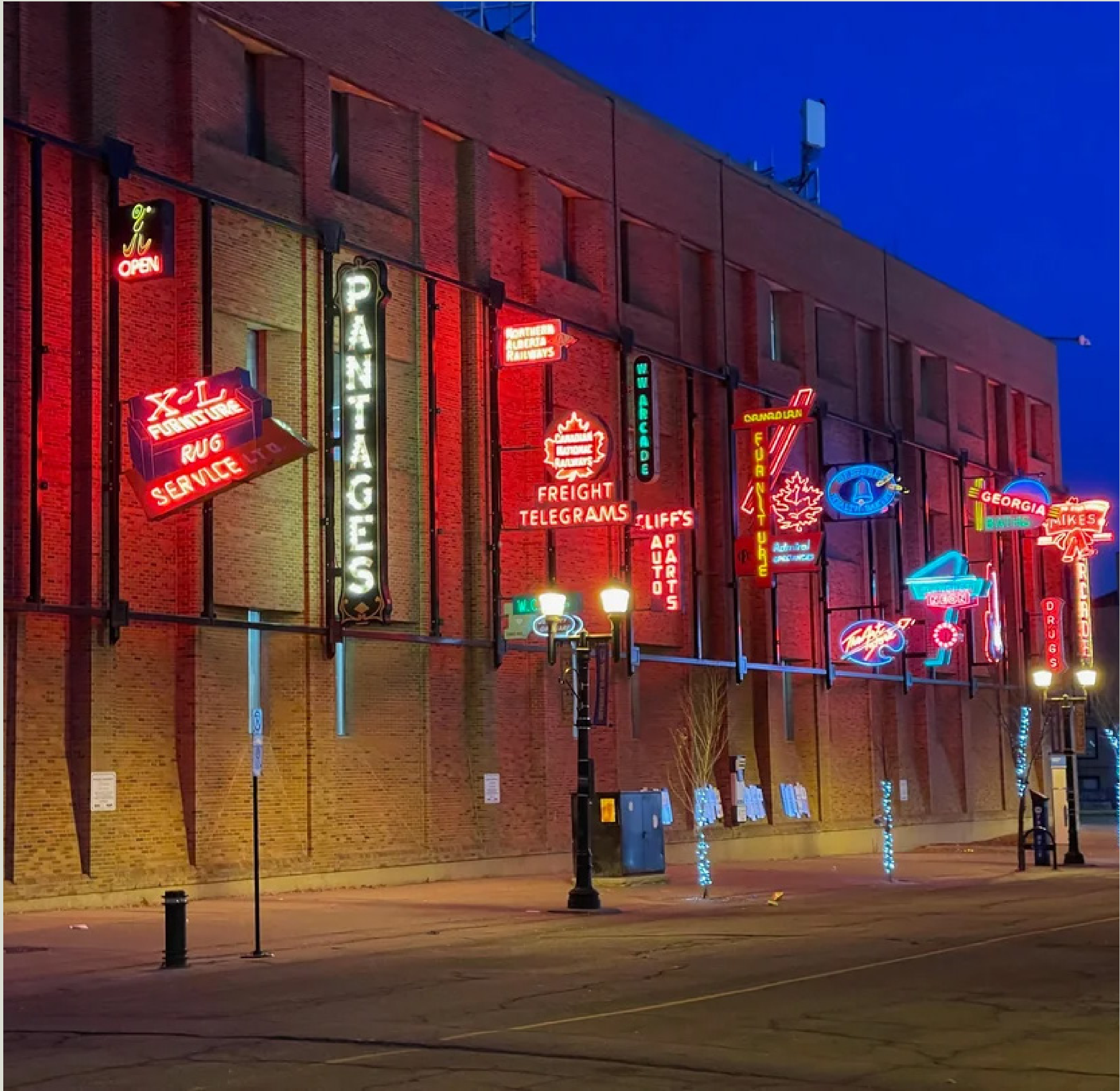
Neon Sign Museum

The exterior walls of the Mercer and TELUS buildings host the Neon Sign Museum. This unique open-air showcase functions as a gateway between Rogers Place and the 104 Street Promenade.