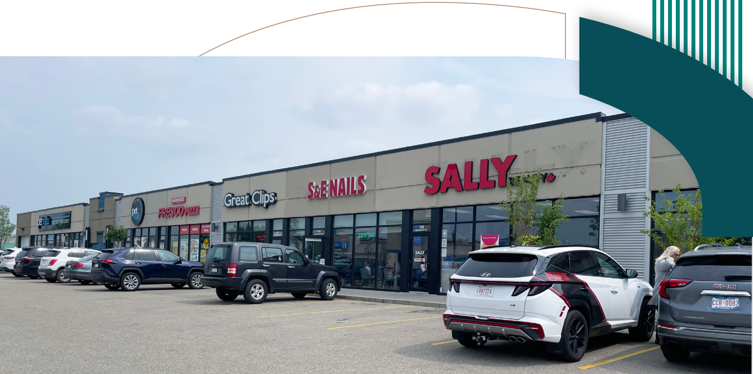
UNIT 386, 222 BASELINE ROAD 1,017 SF