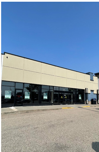
UNIT 25, 100 BROADVIEW DRIVE 11,969 SF - LEASED