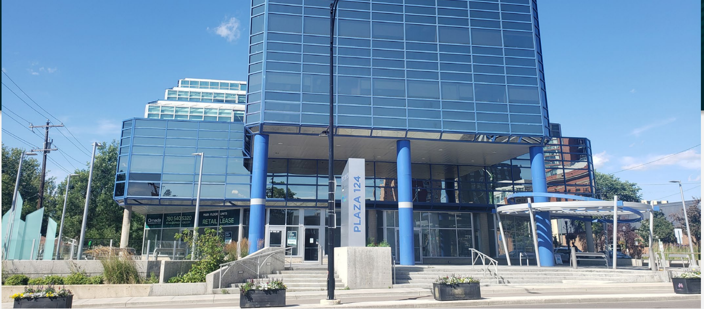
1,454 SF - INTERIOR