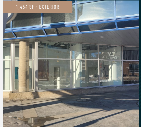
1,454 SF - EXTERIOR